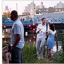
Celebration at the Edge of Decay