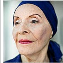
Still Dancing. Her Way. From the Soul