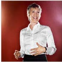
Carly Fiorina Means Business