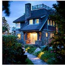
A New England House With Fluid Design